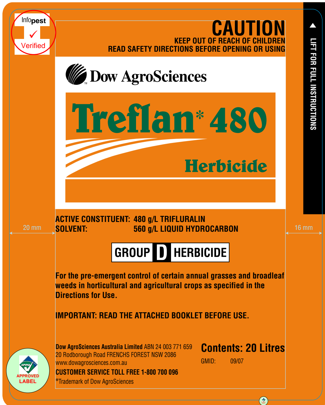
Cover Label: 170 mm (h) x 136 mm (w)