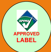
Back label: 170 mm (h) x 136 mm (w)