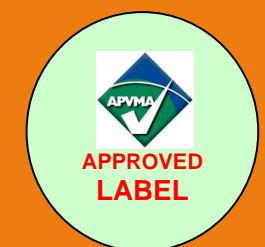
Base label: 185 mm (h) x 450 mm (w)

Workhouse job #: DE14168 Artwork revision date: 17/10/07