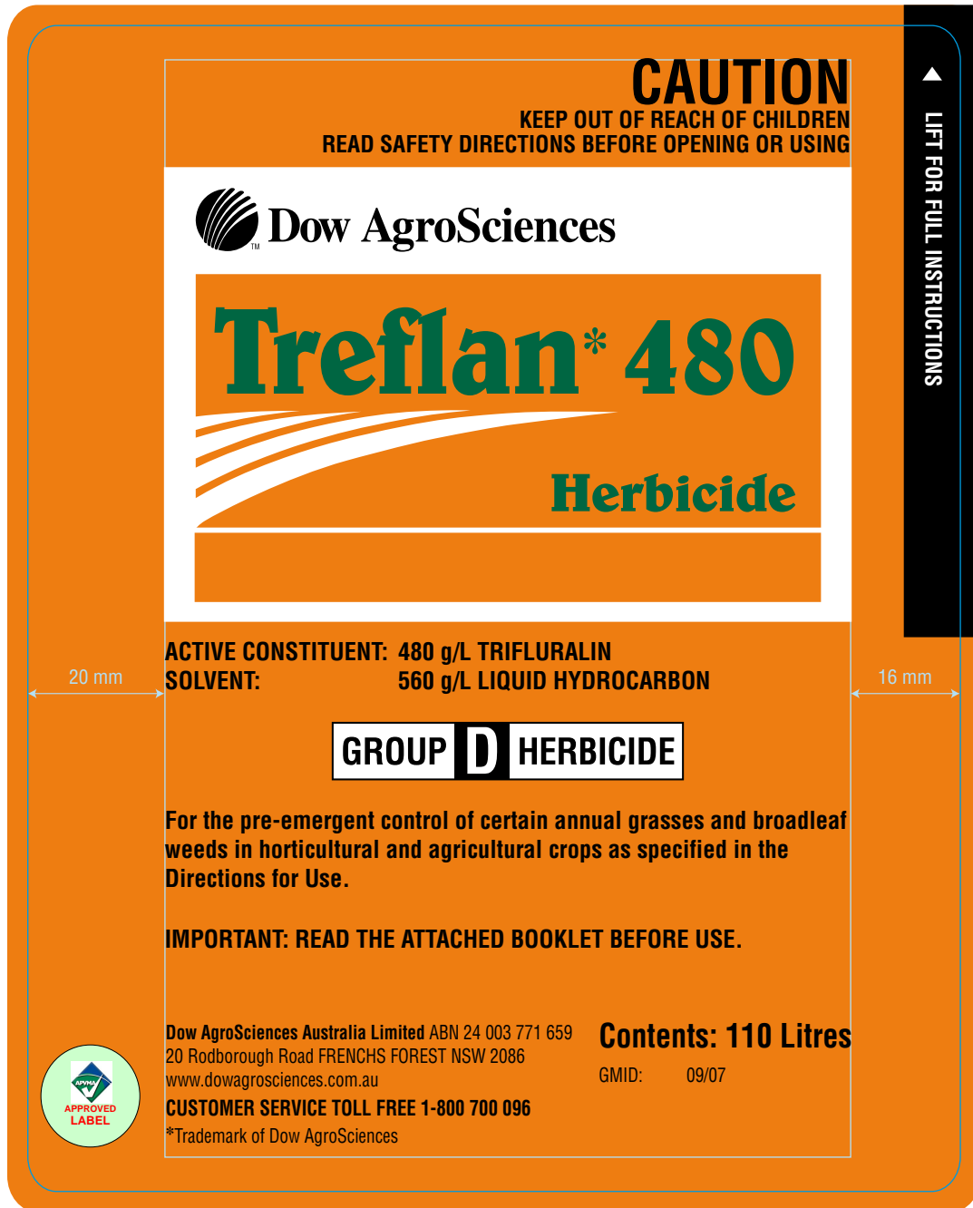
Cover Label: 170 mm (h) x 136 mm (w)